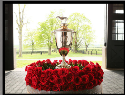
Kentucky Derby trophy on display before the race. How magnificent and beautiful! We at Merica House are even luckier to have won the hearts of so many wonderful friends and supporters!